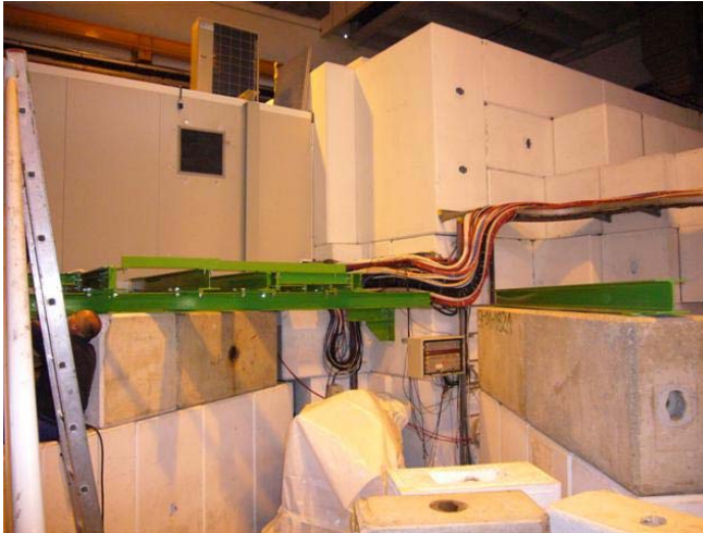
Installation of the platform, final stage: 09-08-07