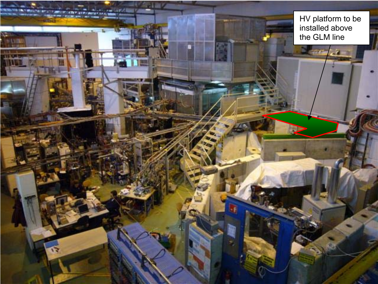
Assembling of the platform in the SAS: 06-08-07